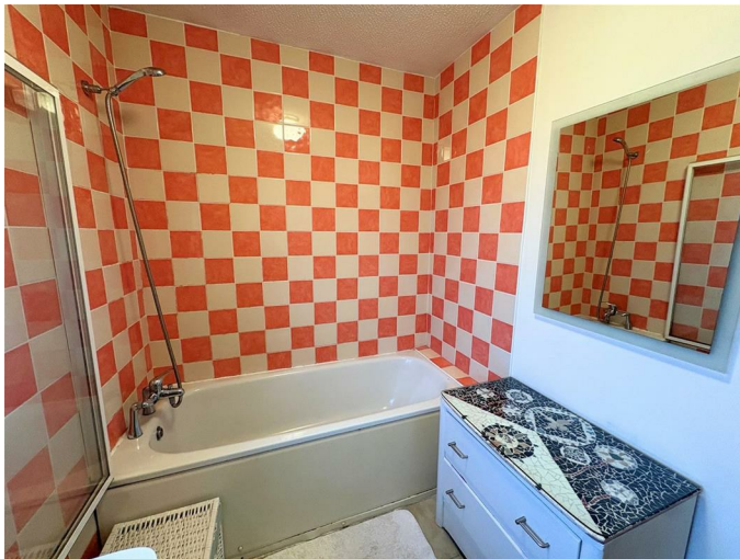
Bathroom 7'10" x 5'8" (2.40 x 1.75)

Textured ceiling, skimmed and tiled walls, tiled flooring, radiator, two piece suite comprising a panel bath with shower over and glass privacy screen and a pedestal wash hand basin, uPVC double glazed window with obscured glass to the rear.